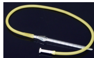
blood diluting pipettes for red corpuscles