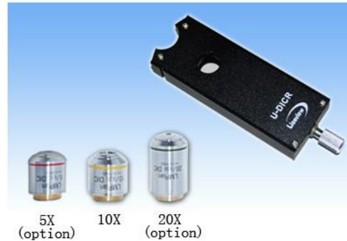
5X (option) 10X 20X (option)

Equip high quality 10X DIC objectives and DIC observation system., in ord to show the clear ,porfile salint and 3D embossed image.